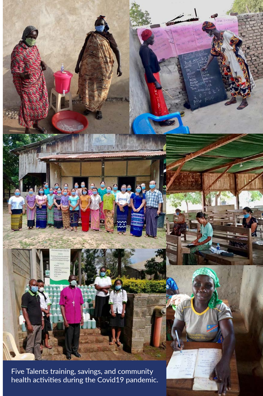
Five Talents training, savings, and community health activities during the Covid19 pandemic.